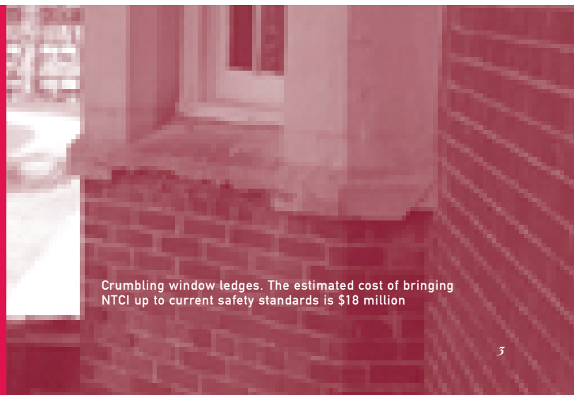
Crumbling window ledges. The estimated cost of bringing NTCI up to current safety standards is $18 million