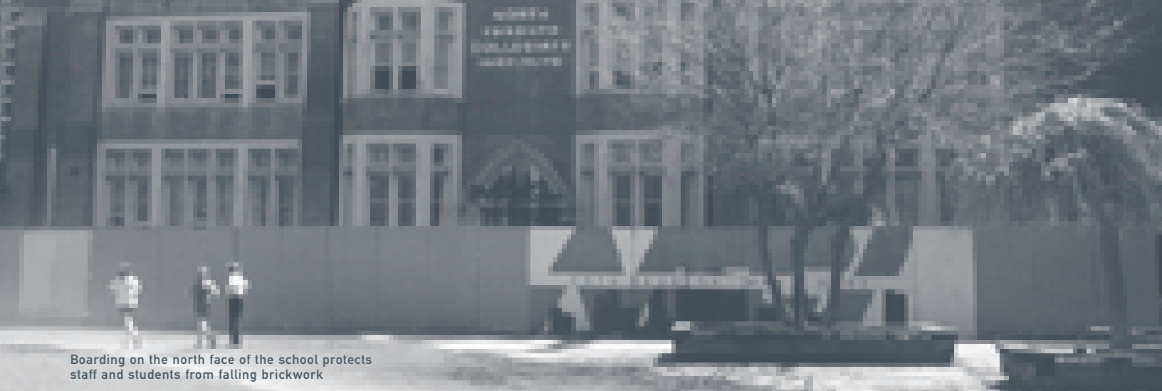
Boarding on the north face of the school protects staff and students from falling brickwork

The Board has also met with the city’s Parking Authority to discuss moving the adjacent parking lot to a parking garage under the school. It is hoped that the current parking lot can be incorporated into the school site, allowing NTCI to expand the size of its footprint on the land.