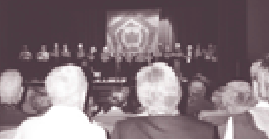
Former staff strut their stuff at "The Show" Top: The glories of yesteryear were on display everywhere